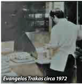
Evangelos Trakas circa 1972