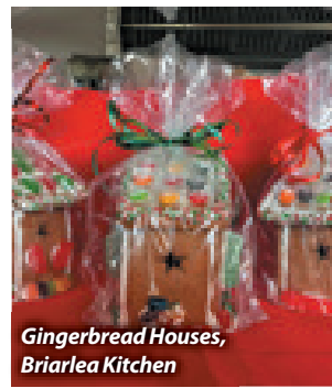
Gingerbread Houses, Briarlea Kitchen