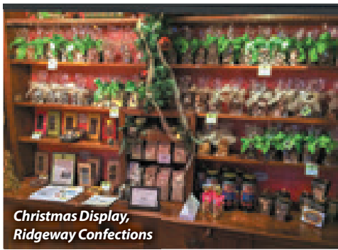
Christmas Display, Ridgeway Confections