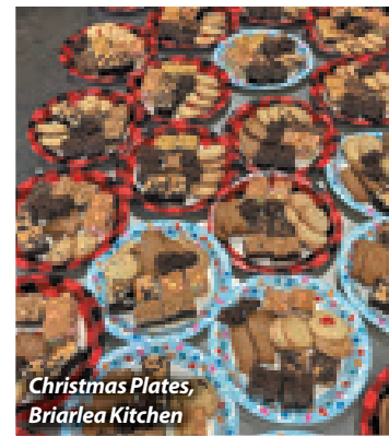
Christmas Plates, Briarlea Kitchen