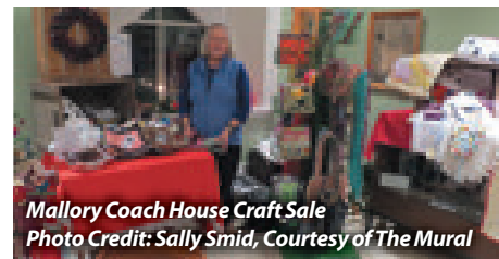
Mallory Coach House Craft Sale