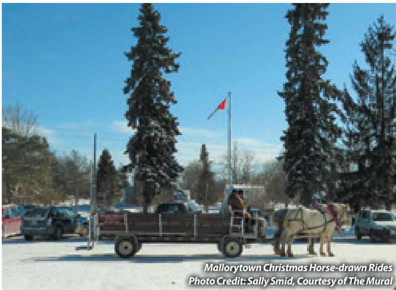
Mallorytown Christmas Horse-drawn Rides