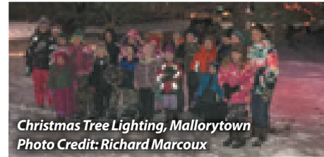
Christmas Tree Lighting, Mallorytown