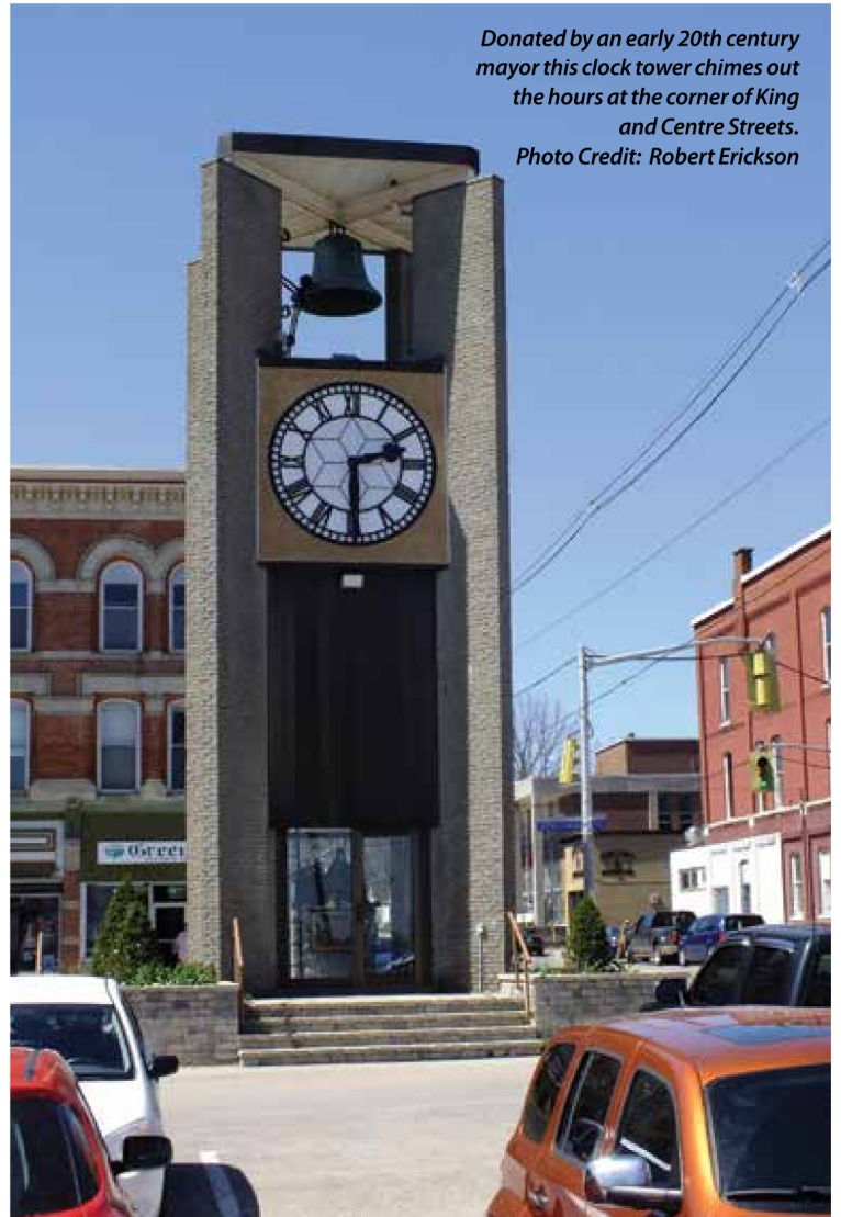
Donated by an early 20th century mayor this clock tower chimes out the hours at the corner of King and Centre Streets.