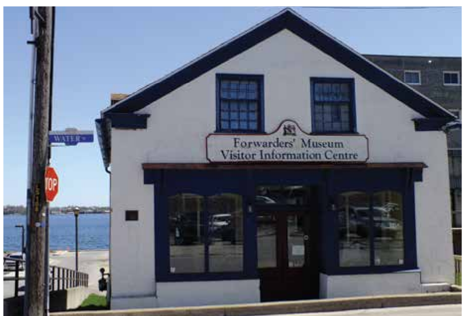
A tourist information center as well as a tiny museum about the shipping along the St. Lawrence.

This is only a sampling of the things to explore while you visit Prescott. There are also a variety of events and festivals throughout the summer months. LH