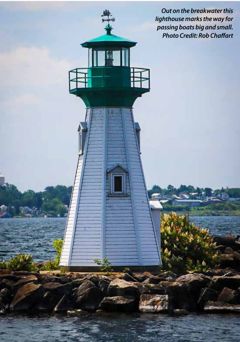
Out on the breakwater this lighthouse marks the way for passing boats big and small.