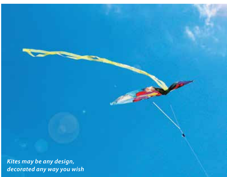
Kites may be any design, decorated any way you wish