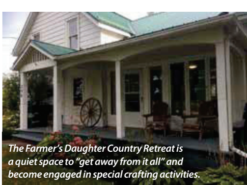
The Farmer's Daughter Country Retreat is a quiet space to "get away from it all" and become engaged in special crafting activities.