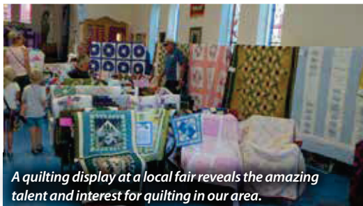
A quilting display at a local fair reveals the amazing talent and interest for quilting in our area.