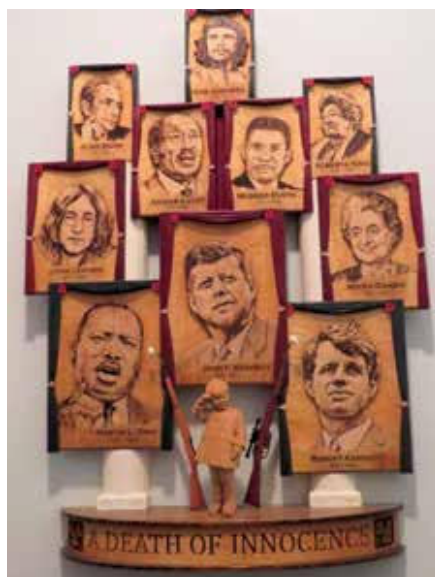
Tony's Death of Innocence portrays a collection of historical figures who were assassinated and were lost before their time.